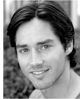
Evan Farmer Host , "While You Were Out" (TLC) Fill-in host , "Total Request Live" (MTV)