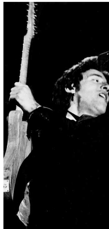
GLOBE STAFF FILE PHOTO/STAN GROSSFELD

SOURCE: Boston Red Sox, Aramark, mayor's press office, Globe archives